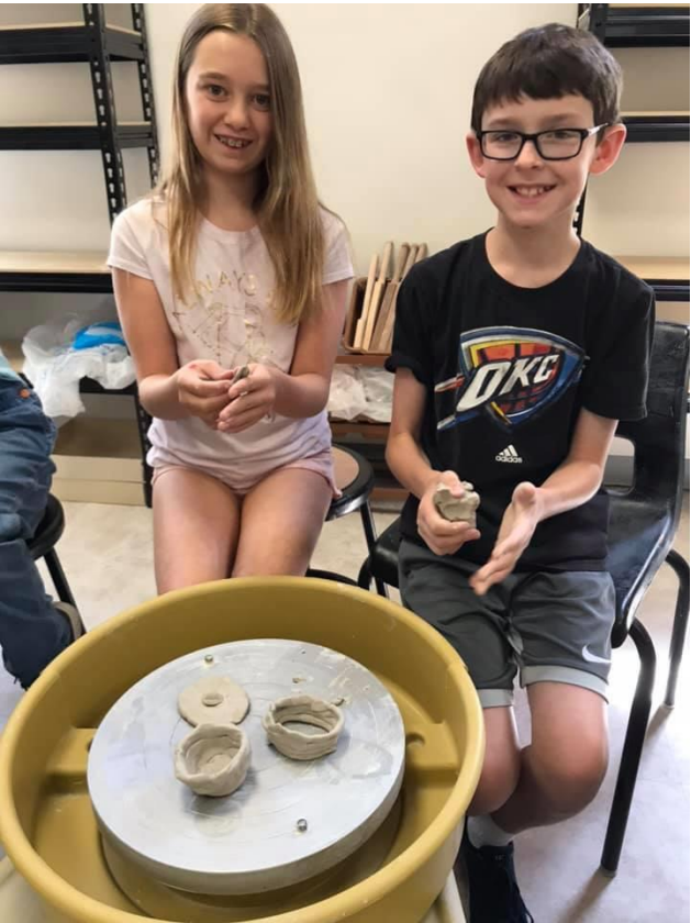
Summer Campers enjoying d' Art Center's Ceramic Studio during Art and Math week